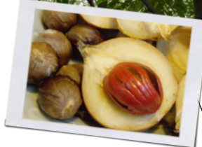
→ Nutmeg Fruit and Seeds