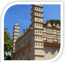
4 Nagore Dargah Indian Muslim Heritage Centre