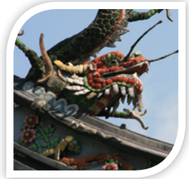
3 Thian Hock Keng Temple