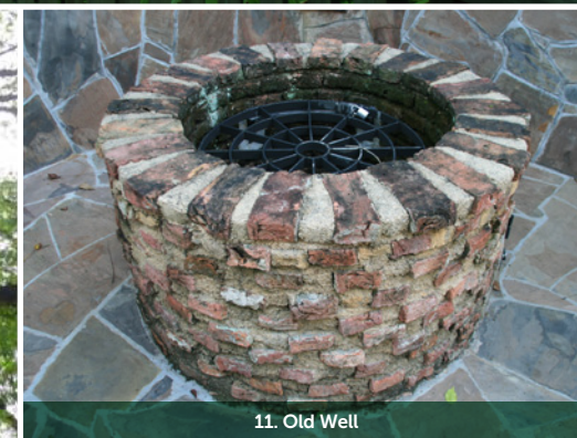
11. Old Well