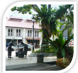
1 Telok Ayer Street