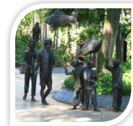
6 Telok Ayer Green