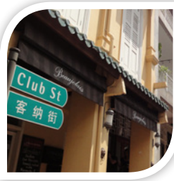
15 Club Street