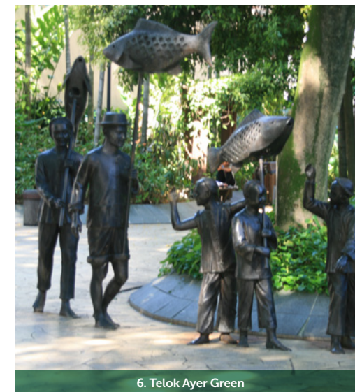
6. Telok Ayer Green

Situated on the corner of this street, this building has been a meeting place and house of worship for Indian Muslims since the 1820s. Look at the interesting architecture of the shrine – it is an unusual blend of classical Western motifs (arches springing from Western-style columns) and Indian influences (the perforated grilles and walls). This shrine was gazetted as a National Monument in 1974.