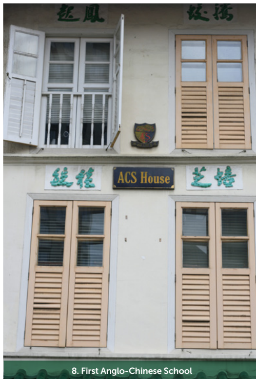
8. First Anglo-Chinese School