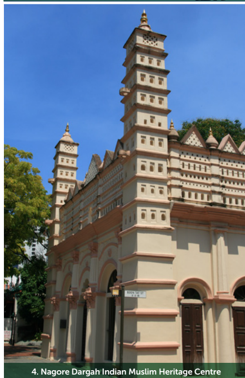
4. Nagore Dargah Indian Muslim Heritage Centre