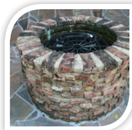
11 Old Well