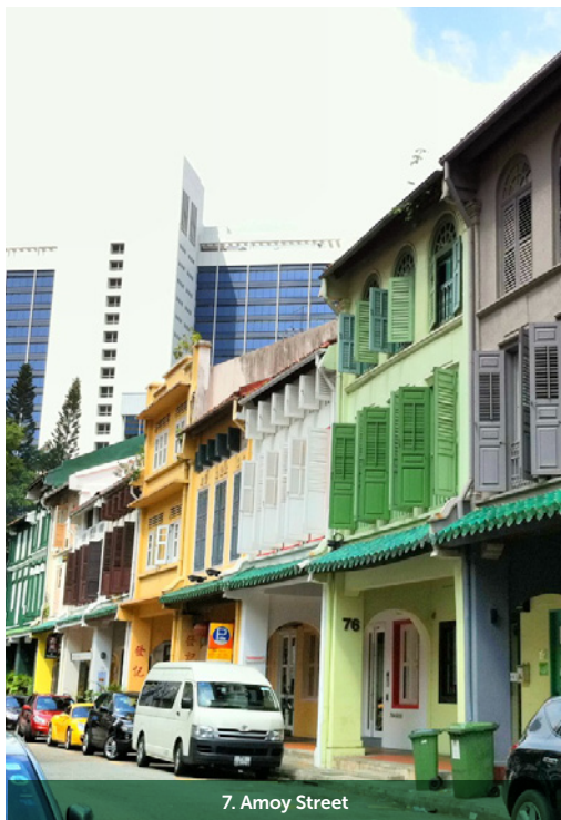
7. Amoy Street