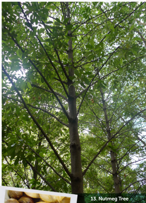
13. Nutmeg Tree

Look out for the Cinnamon Tree in this park. This is a small evergreen tree with oblong-shaped leaves. When young, the leaves are reddish pink, adding colour and vibrancy to the entire tree. Its flowers are greenish in colour and emit a distinct smell. The spice, cinnamon, is obtained from the bark of the tree.