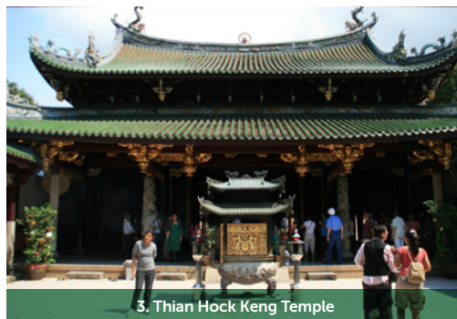
3. Thian Hock Keng Temple