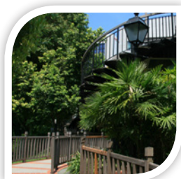
9 Ann Siang Hill Park