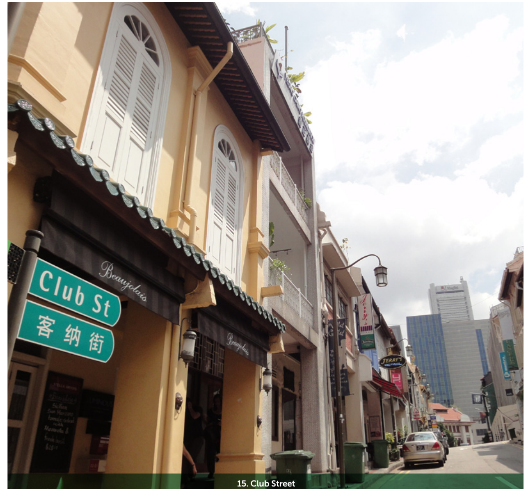
15. Club Street

Exit Ann Siang Hill Park and walk along the back of Ann Siang Road to get to Club Street. This street got its name from the various Chinese clubs that lined this street from as far back as 1891, including Kee Lam Club (a leading Straits Chinese club for several decades), Chui Lan Club (a meeting place for wealthy Chinese businessmen) and Ee Hoe Club (the most exclusive and prestigious of Chinese clubs founded by a group of Hokkien businessmen).