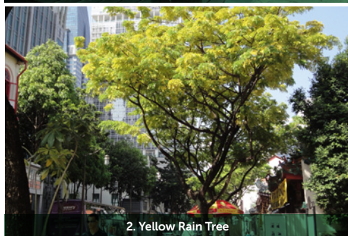
2. Yellow Rain Tree