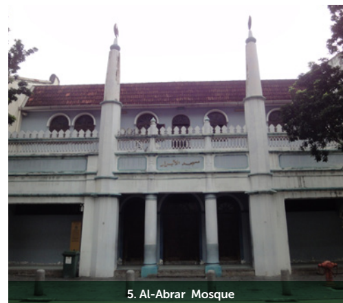
5. Al-Abrar Mosque

The Rain Tree is commonly planted along Singapore's roads for the shade its large, umbrella-shaped crown casts over surrounding areas. Its leaves often fold up at dusk or before a rainstorm, hence its name.