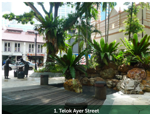
1. Telok Ayer Street