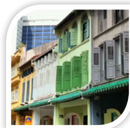
7 Amoy Street